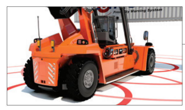
Two antennas have been installed at the back covering steer area of the reachstacker.