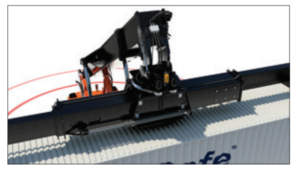
An antenna can be installed to the reachstackers spreaders or other attachments to create a moving detection zone.